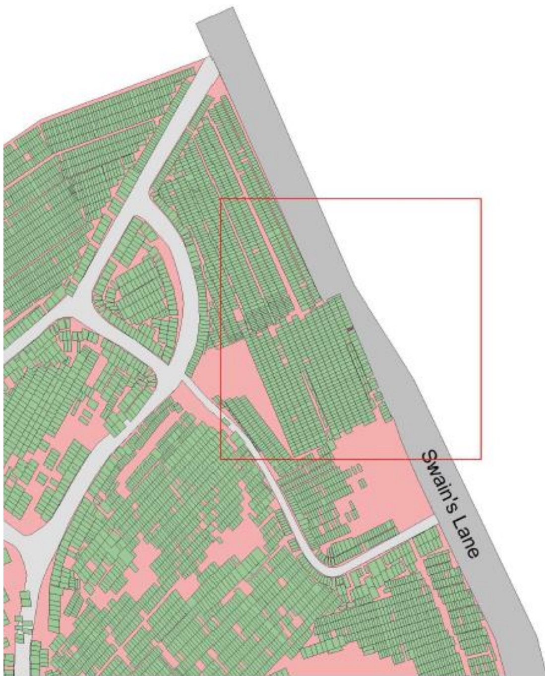
Map of Highgate cemetery. Dorcas barleycorn's grave is marked in red.