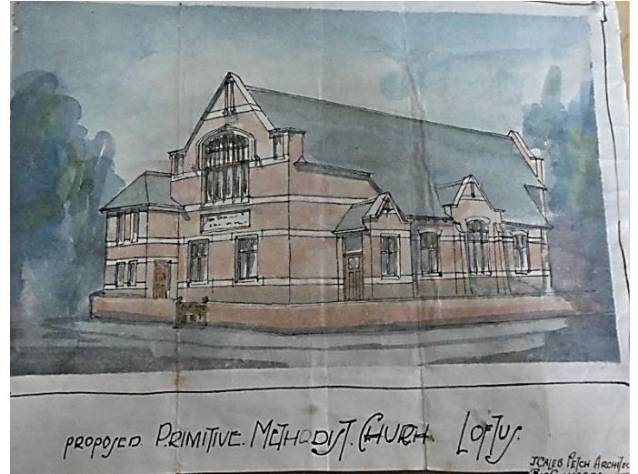
Proposed Primitive Methodist Church 1910 Architectural drawing

This drawing was displayed in the café that is part of the present buildings that comprise The Grace Community Centre. I had permission to photograph the drawing.