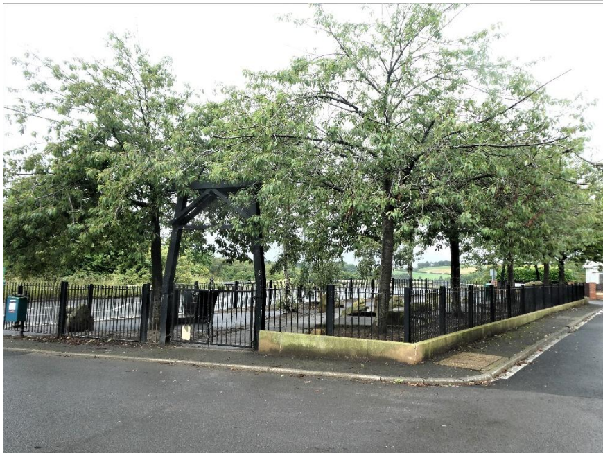
This is the area where the 1 st Primitive Methodist Chapel was built. Now a small area of a park as photo'd in 2023

In the subsidence a hen-house went down to the lower level; but the hens appear quite happy in their new surroundings. Further subsidences may completely bury them. Two goats which also went down were rescued none the worse.