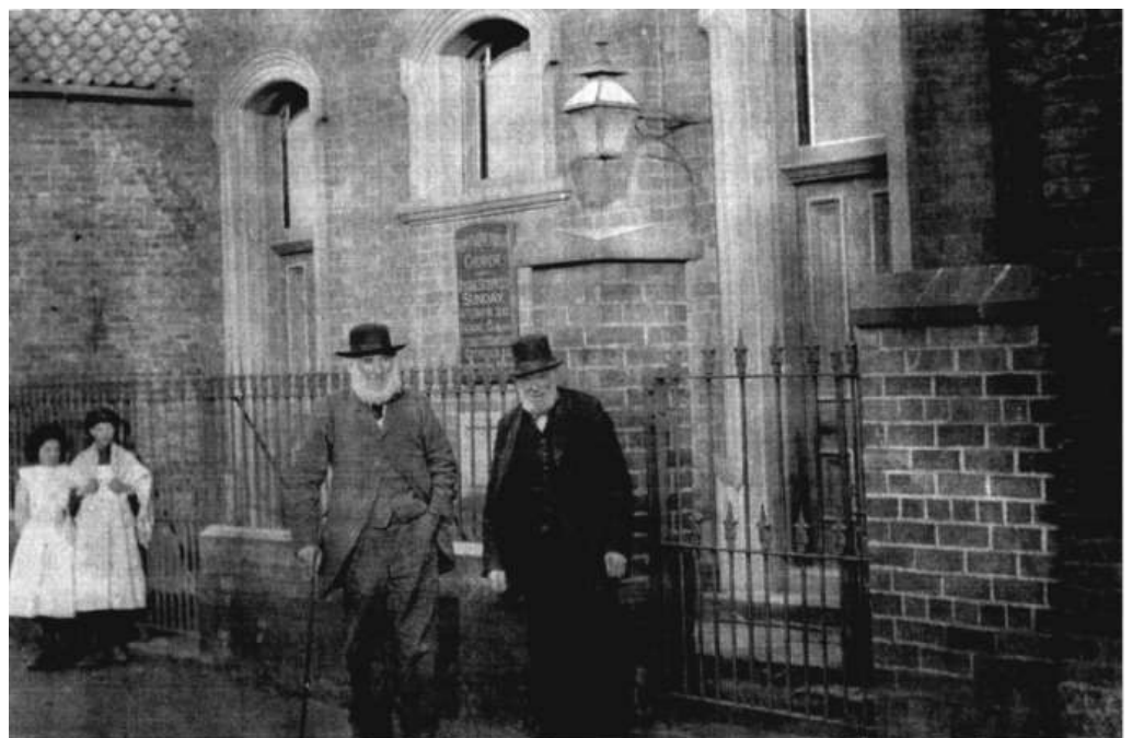
Primitive Methodist Chapel, Baxtergate c. 1910

The chapel had two entrance doors with three windows spaced out evenly over the doors. These windows were of frosted glass with a coloured glass surround. There were three windows on each side of the building. The pulpit was at the front of the chapel between the two entrance doors, semicircular in shape and reached by a flight of steps at each side. The choir seats and organ were between the two entrance doors, behind the pulpit. The floor rose in steps to the rear of the building and there were eight rows of pews. Pew rents were charged, so that a whole family would sit in "their" pew. At the rear of the chapel there was a door leading to the schoolroom which was divided into three separate rooms.