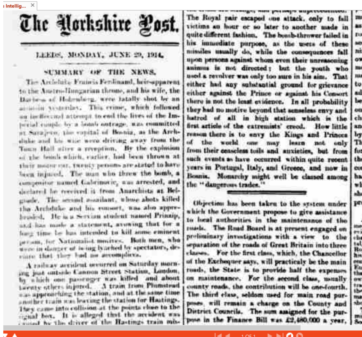
Yorkshire Post and Leeds Intelligencer 29 Jun 1914 - News of the assassination of the Archduke Franz Ferdinand.