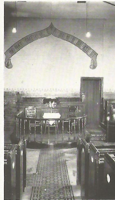
The Interior of Clayhanger Methodist Church taken in the 1930's.